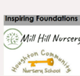
INSPIRING FOUNDATIONS: CURRICULUM DESIGN PROGRESSION & INSPIRING ENVIRONMENTS