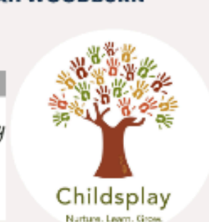
CHILDSPLAY NURSERY CONNECTING TO NATURE