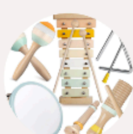
CLAIRE TUSTIN: USING MUSIC EFFECTIVELY IN THE EARLY YEARS