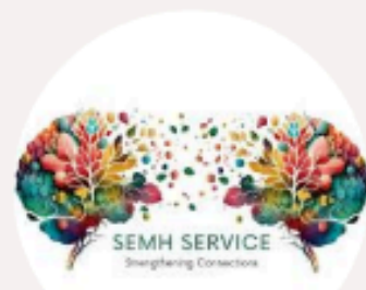
NEWCASTLE SEMH TEAM & KEY NOTE FROM SARAH WOODBURN